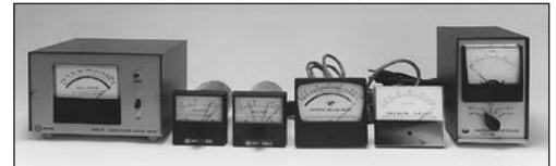
Reconditioned Thermocouple Gauge Controllers

Items are subject to availability. All units come with our standard 90-day warranty covering all parts and labor.