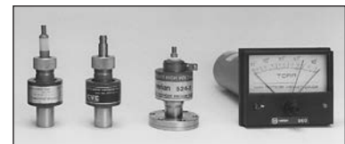
CVC GPH-001 & Varian GPH-001A Varian 524 Varian 860