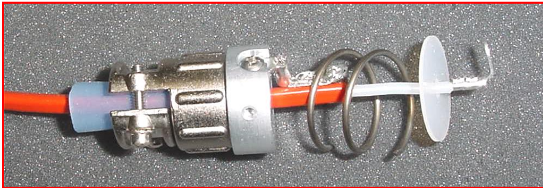
Figure 3 - Assembly Through Step 7