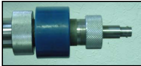
CVC GPH-001A Discharge Tube*

For the CVC GPH-001A Penning Discharge Gauges, the 751A operating voltage can be set to +3,500 volts, the maximum current to 3 mA and the pump size can be set to 0.7 l/s (this setting tells the control unit to calculate the pressure from the gauge current with a constant of 6 amps per torr, just like the original CVC control units.)