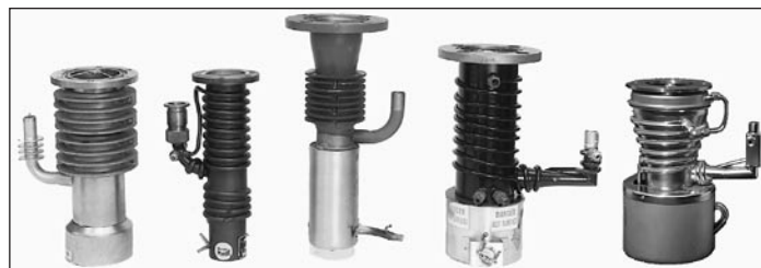
Veeco 3" 4530-009 CVC 2" PMC-2 Varian 2" HSA Varian 2" HS2 Innotec 2" R-220

All rebuilt diffusion pumps are completely rebuilt in-house and come with our standard 90-day warranty on all parts and labor. Rebuilt items are subject to availability. Please call for stock.