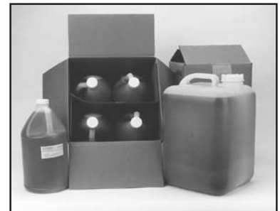
TABLE OF EQUIVALENT OILS