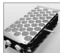
Galaxy Captorr Element