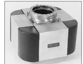
Perkin Elmer 220 l/s