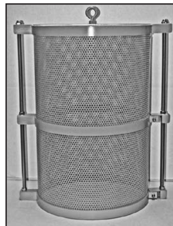
Metal Guard for Bell Jar