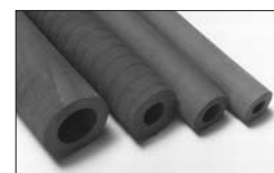
Gum Rubber Tubing