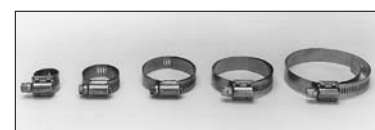
Liner type hose clamps prevent hose from extruding through thread holes in the band.