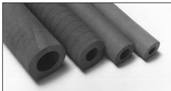
Gum Rubber Tubing

Sections longer than 4-8" must be supported internally.