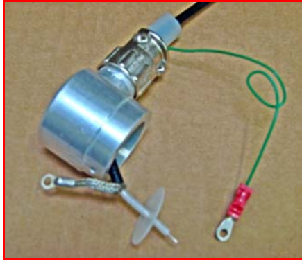
Figure 2 – Initial Assembly and Cable Preparation