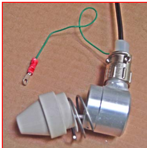
Figure 4: Ceramic Insulator End Cap Assembly