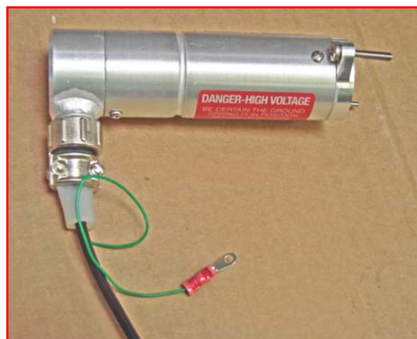
Figure 5: Fully Assembled S-100-X Connector