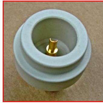
Figure 3: Center Connector Socket Installed in the Ceramic Insulator