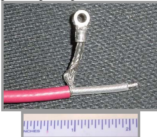
Figure 2 – HV Cable Prep