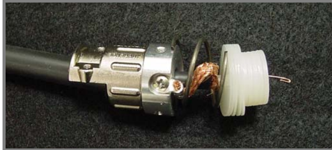
Figure 2 - Assembly Through Step 7