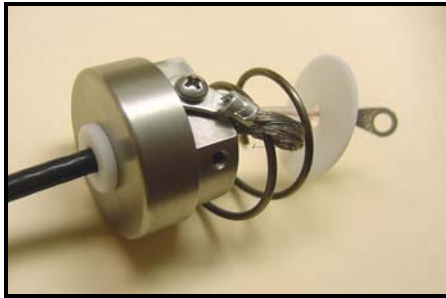
Figure 4 – Cable Assembly Through Step 8