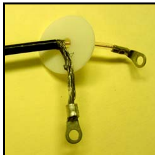
Figure 3 – HV Cable Prep Through Step 6