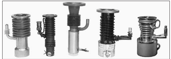
Veeco 3" 4530-009 CVC 2" PMC-2 Varian 2" HSA Varian 2" HS2 Innotec 2" R-220